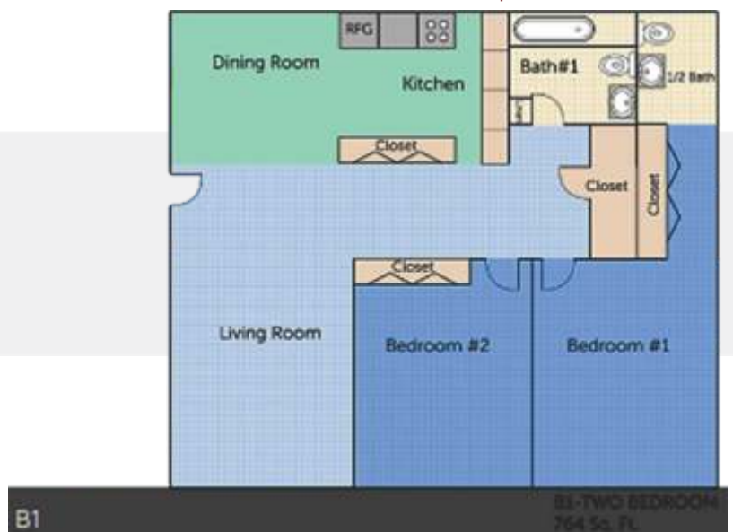
B1 2 Bed / 1 Bath 764 Sq. Ft.*