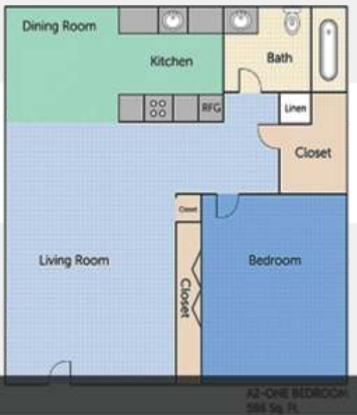
A2 1 Bed / 1 Bath 586 Sq. Ft.*